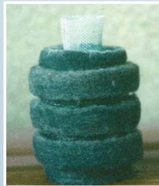
After 2nd 500 gallon treatment