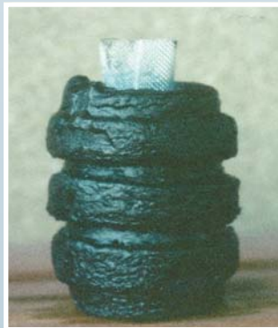
After 1st 500 gallon treatment